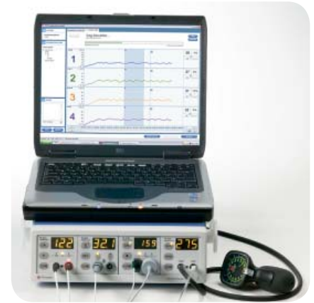
PeriFlux System 5000 equipped with PF 5010 Laser Doppler Unit, PF 5020 Temp Unit, PF 5040 tcpO 2 and PF 5050 Pressure Unit.

PeriFlux System 5000 offers an operator-independent, non-invasive solution for endothelial function assessments in the skin. It is a modular system with flexibility in the number and function of channels included. Laser Doppler technology can be combined with a heat unit, transcutaneous oxygen unit and/or pressure unit allowing for a range of different approaches to study the peripheral circulation. To further extend the possibilities, various laser Doppler probes suitable for measurements in different tissues/organs have been designed. The comprehensive PeriSoft for Windows software is used to operate the system and for data analysis.