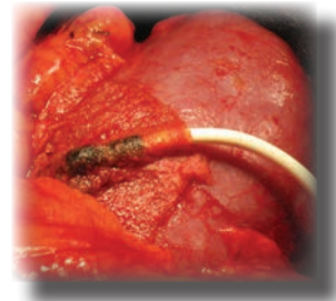
Monitoring kidney after transplant with PROBE 404