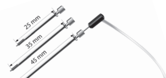
Bone probe with bone-probe holder attached

PROBE 407 offers a simple and straightforward solution for monitoring superficial flaps. The probe is small and flexible in its design, making it easy to fix to the skin using double-sided adhesive tape and a probe holder. Probe holders with pre-drilled holes are available if suturing is necessary.