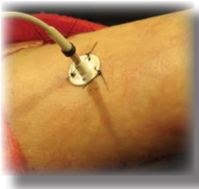
Groin flap to arm, PROBE 407 with sutures probe holder