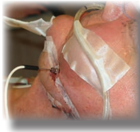
Fibula flap to mandible, Bone PROBE 426