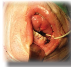
Mouth floor reconstruction with PROBE 404